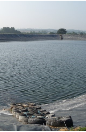
Our reservoirs protect us from drought periods and optimize growth of plants. (The tyres allow foxes etc to get out if trapped)

Palmstead are one of the most sustainable growers in the UK. All our irrigation water comes from rainfall harvesting and is stored in two large reservoirs holding 50 million litres. This saves using expensive mains drinking water for irrigating plants and gives us 4-5 months capacity at peak usage in the spring. So as long as we get some summer rainfall we have plenty of water to use in our forever updated computer controlled irrigation system.