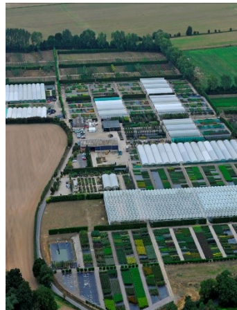
Aerial view of the nursery

Over the years we have invested in the nursery with protected space (tunnels and glasshouses) these extend our growing season in pots and allow us to produce